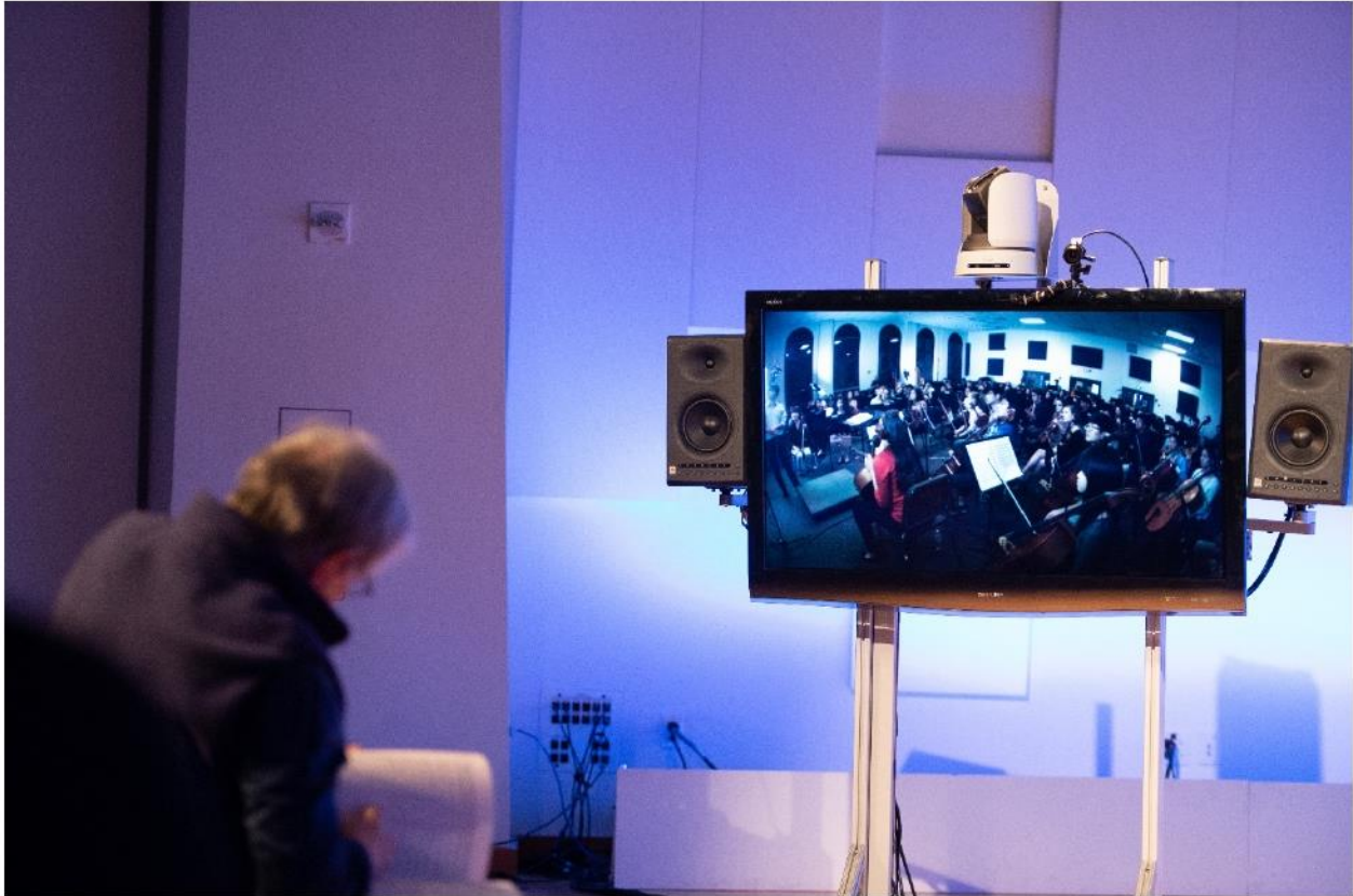
Image 1. Image: Michael Tilson Thomas leads an Atlanta Symphony Youth Orchestra rehearsal over Internet2's LOLA from the New World Symphony campus in Miami Beach, FL.